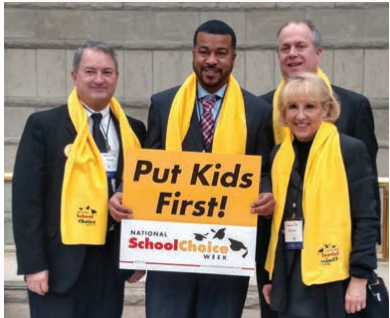
Photo: Michigan Catholic Conference and other school choice advocates participated in National School Choice Week in Detroit in 2017, calling for all families to have the educational options that fit best for their children.