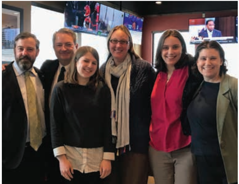
Photo: MCC advocates work closely with lawmakers and staff to ensure the positions of the Catholic Church are heard in matters of public policy.